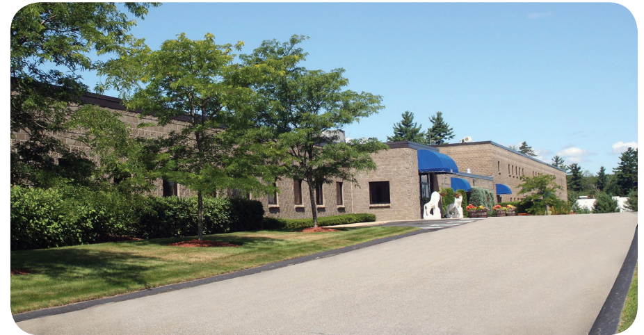
Advanced Cable Ties, Inc. corporate headquarters and manufacturing facility in Gardner, Massachusetts.

We invite you to meet with our team, visit our website, tour our USA manufacturing operation, or request samples of our products. We are confident you will be completely satisfied with every aspect of your experience with Advanced Cable Ties.