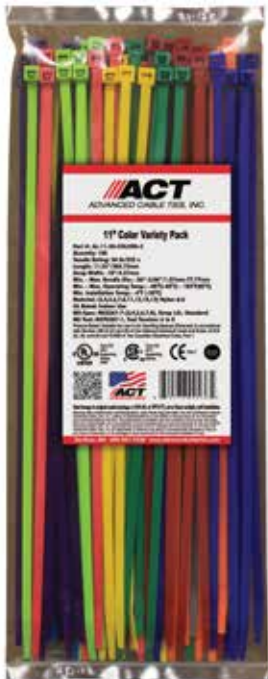
COLOR VARIETY PACK