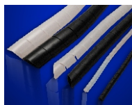
Spiral Cable Wrap

ACT ADVANCED CABLE TIES, INC. 245 Suffolk Lane, Gardner, MA 01440 Phone: 800.861.7228 - Fax: 978.630.3999 sales@actfs.com