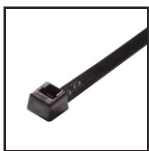
Standard Cable Ties