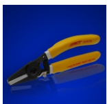
Cable Tie Removal Tool