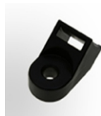
Heavy Duty Impact Resistant Screw Mounts

ACT ® ADVANCED CABLE TIES, INC. 245 Suffolk Lane, Gardner, MA 01440 Phone: 800.861.7228 - Fax: 978.630.3999 sales@actfs.com