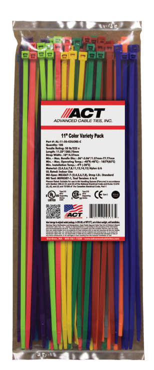
COLOR VARIETY PACK