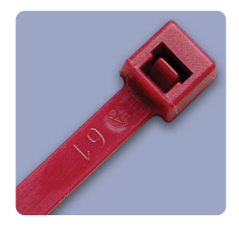
For Air Handling Cable Ties See Page 13