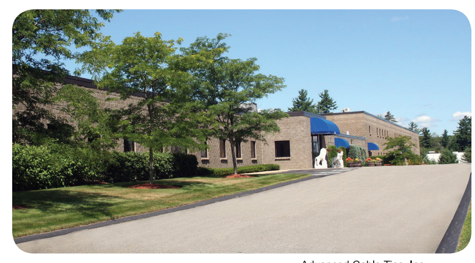
Advanced Cable Ties, Inc. corporate headquarters and manufacturing facility in Gardner, Massachusetts.

We invite you to meet with our team, visit our website, tour our USA manufacturing operation, or request samples of our products. We are confident you will be completely satisfied with every aspect of your experience with Advanced Cable Ties.