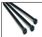
Heat Stabilized UV Black Nylon 6/6