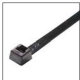
Standard Cable Ties