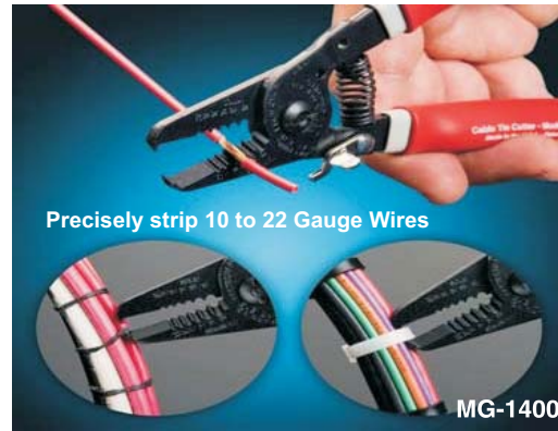
MG-1400 Patent # 8,365,418