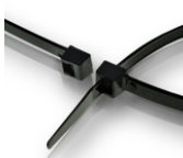
Impact Resistant Cable Ties