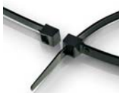
Impact Resistant Cable Ties