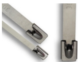
316 Stainless Steel Cable Ties