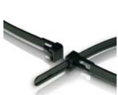
Releasable Cable Ties