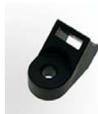
Heavy Duty Impact Resistant Screw Mounts

ACT ADVANCED CABLE TIES, INC. 245 Suffolk Lane, Gardner, MA 01440 Phone: 800.861.7228 - Fax: 978.630.3999 sales@actfs.com