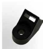
Heavy Duty Impact Resistant Screw Mounts

ACT ADVANCED CABLE TIES, INC. 245 Suffolk Lane, Gardner, MA 01440 Phone: 800.861.7228 - Fax: 978.630.3999 sales@actfs.com