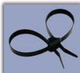
Dual Loop Cable Ties

ACT ADVANCED CABLE TIES, INC. 245 Suffolk Lane, Gardner, MA 01440 Phone: 800.861.7228 - Fax: 978.630.3999 sales@actfs.com