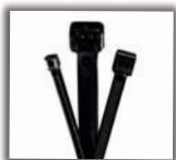
Heat Stabilized UV Black Nylon 66