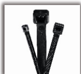
Heat Stabilized UV Black Nylon 66