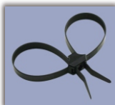
Dual Loop Cable Ties

ACT ADVANCED CABLE TIES, INC. 245 Suffolk Lane, Gardner, MA 01440 Phone: 800.861.7228 - Fax: 978.630.3999 sales@actfs.com